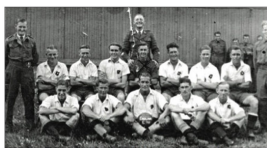
Illustration 28: British football team at Auschwitz